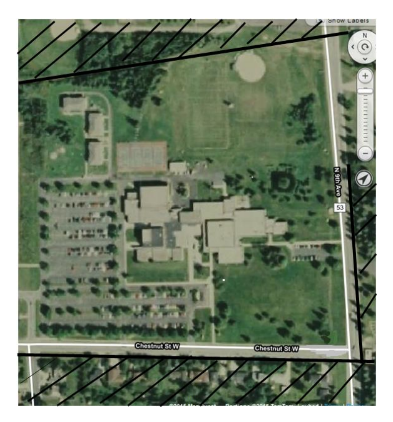
Virginia Non-campus property includes: Mountain Iron – Buhl Football Field – Sporting events