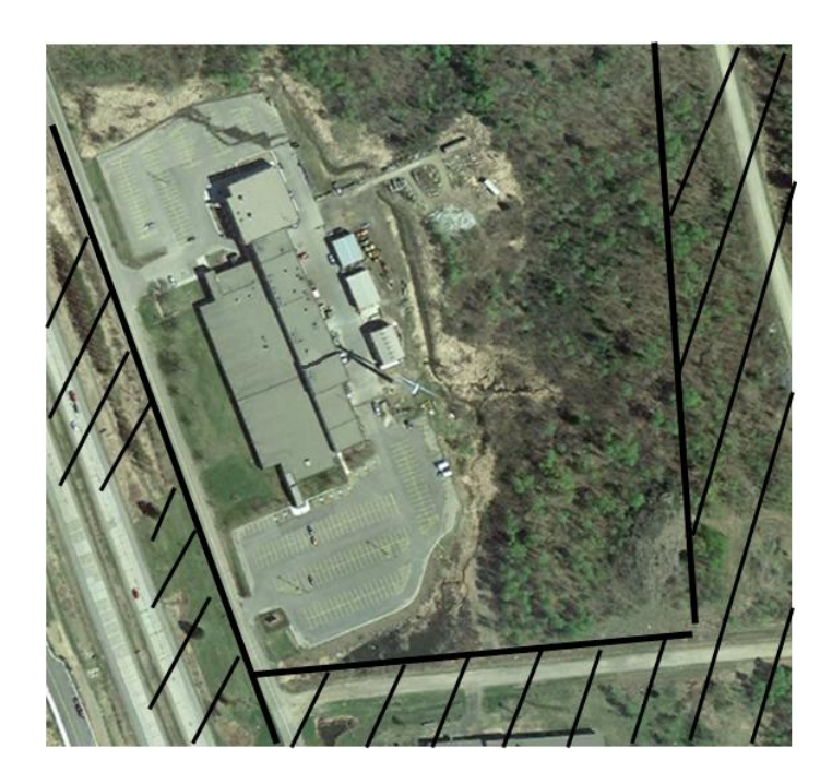
Eveleth Non-campus property includes: None